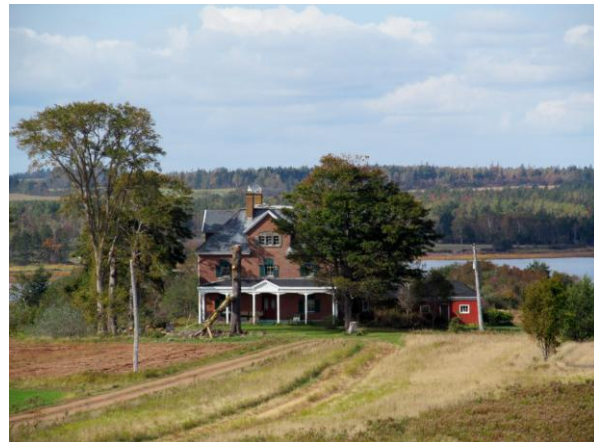
Glenaladale Estate - a place to remember for its historical significance and roots. It's a vision that could be realized! And it is in our area! For more information, to be involved or to make a pledge or donation please contact peisshs@gmail.com or www.glenaladalepei.com or find them on Facebook search Glenaladale House

Visit our website www.tracadiecc.com or like us on facebook Contact us at: tracadie@tracadiecc.com